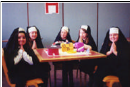
The “Cerebrum Sisters” enjoy Creative Convention at GRC’s Academic Challenge Cup.