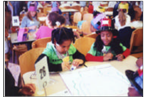
Academic Challenge Cup's Creative Convention promotes concentration and delight!

J Fall enrollment was 270—highest since '92! J Winter enrollment was 354—second highest ever! J Total enrollment for the year was the highest ever! J 70 classes were held this year, ranging from Science at Hogwarts to Ultimate Team Challenge 2001. J 15 classes of the 40 offered during the winter session were filled to capacity—an all-time record! J All winter classes for preschoolers and kindergartners were filled to capacity. J Almost 40 parents attended each of the Parenting Classes on Saturdays during Learning Labs. J Students attending winter Learning Labs came from 64 zip codes!