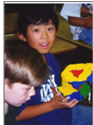
One of GRC’s Math, Marvels & More “Scholars” manipulates a geometric creation.