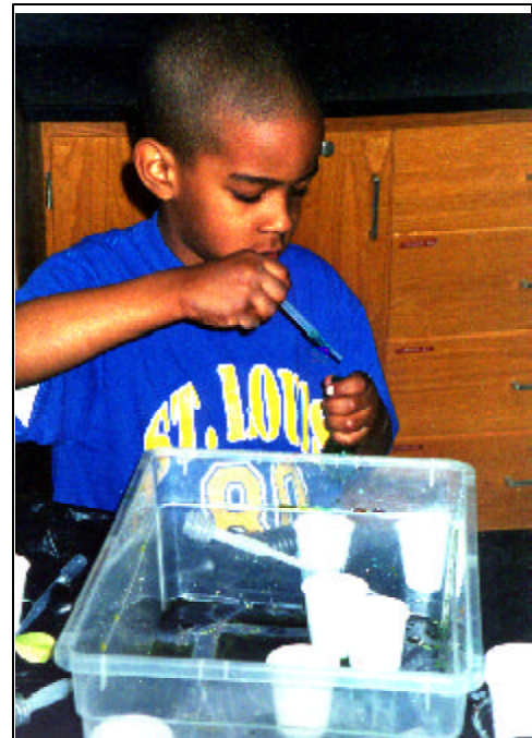
Scientific experimentation is always a popular subject for Learning Lab students.