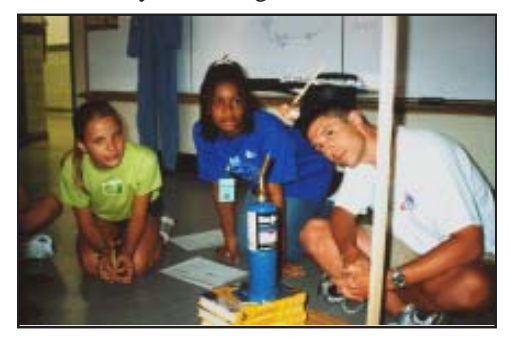
Space Academy cadets intently watch an experiment with their captain.

To learn more details about GRC's Summer Academies, visit www.cybam.com/grc.