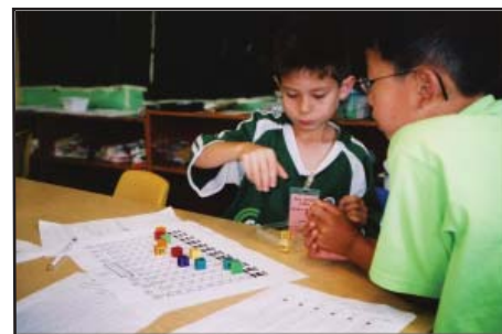
Two Math, Marvels & More 'scholars' are engrossed in a mathematical probability exercise.