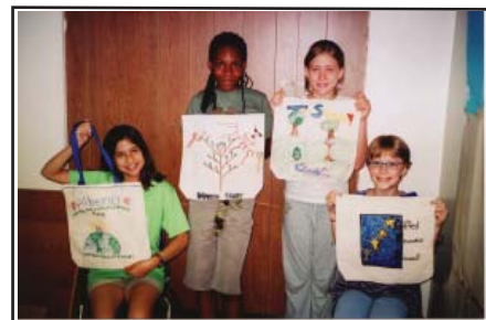
ECO Academy ‘entrepreneurs’ display products of their 2007 business “Bag-It, Inc.”